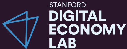
Above Director Erik Brynjolfsson leads the Stanford Digital Economy Lab.